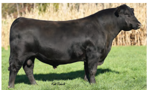
EWA High Weigh 3123 Sire of lot 20