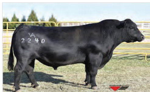
VAR Discovery 2240 Sire of lot 11