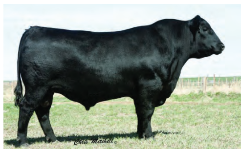
Connealy Mentor 7374 Sire of lot 17