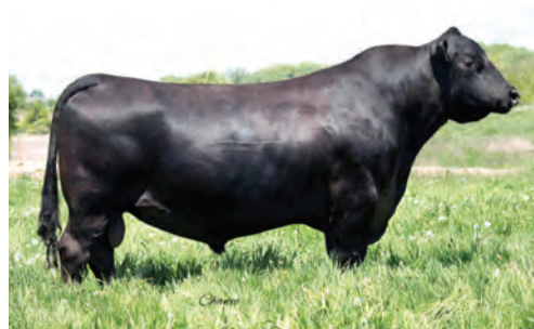
Jindra Acclaim Sire of lots 52 & 83