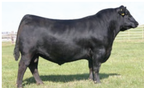
SAV Iron Mountain Sire of lot 13