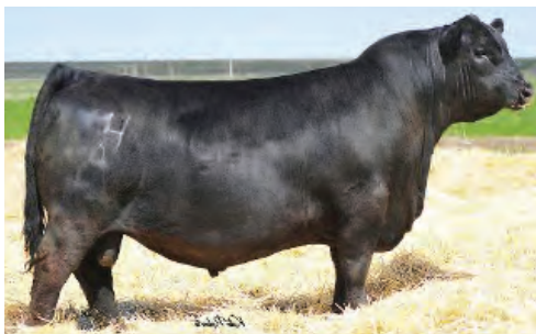
HA Cowboy Up Sire of lots 16, 35 & 37