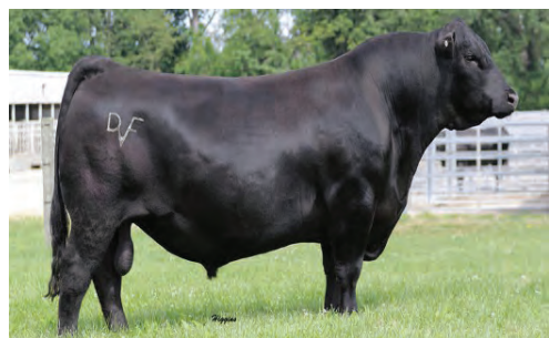
Deer Valley Growth Fund Sire of lots 1, 7-9, 14, 19, 53-54 & 89