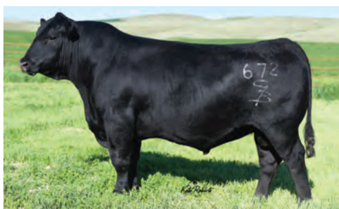
GB Fireball 672 Sire of lots 2 & 4