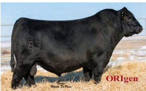
BUBS Southern Charm AA31 Sire of lots 47-51 & 78