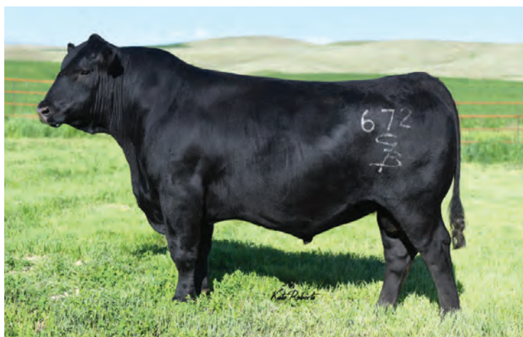
GB FIREBALL 672 - Sire of lots 2 & 4

An impressive profile of genomic EPD's has 14 traits in the top 10% of Angus breed. Top 1% SC, MB, SG, SB, SC. 2% CED, YW, RADG. Top 10% CVW, RE. Analysts traits with a combination with an incredible spread of calving ease to growth. One can describe him as fault-free. BW 64.