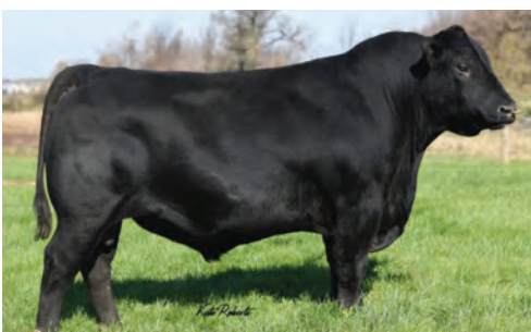
MAF Tanker 23 Sire of lot 24