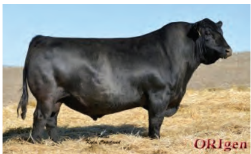
Basin Payweight 1682 Sire of lots 3, 34, 74 & 76