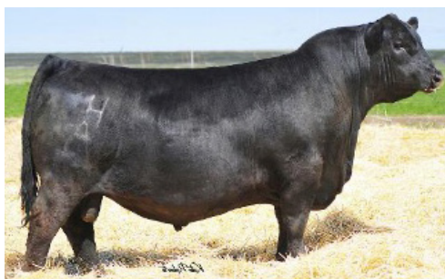
HA Cowboy Up Sire of lots 23