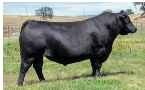
E&B Plus One Sire of lots 6-7, 11, 29, 71