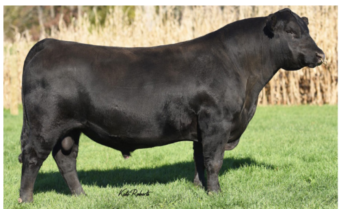
EWA High Weigh 3123 Sire of lot 20