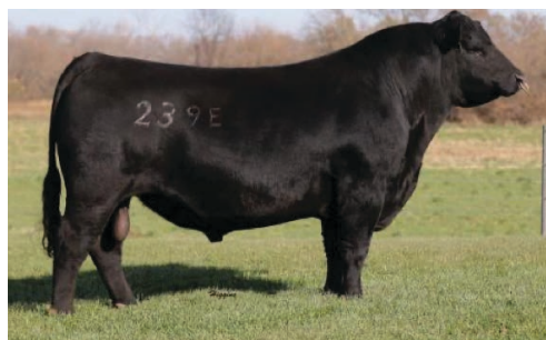
Ferguson Trailblazer 239E Sire of lots 15 & 25