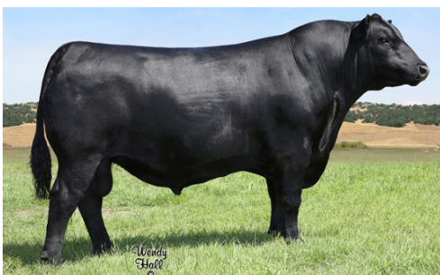
Hoover Know How Sire of lot 12