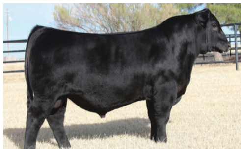
Wilks Regiment 9035 Sire of lots 26, 28, 51