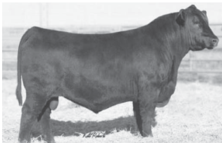
TEHAMA PATRIARCH F028 Sire of lot 38

You can sleep all night with this bull on your heifers with a +13 CED. Check out his Milk (+34), his $EN (+1), his $M (+95), and his $C (+288). His entire Maternal profile is impressive. Keep his heifer calves for sure. You will like his phenotype and disposition.