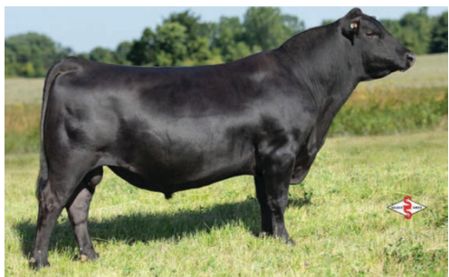
HPCA Veracious Sire of lot 46