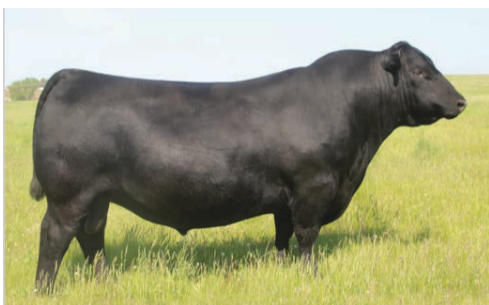
SAV Rainfall 6846 Sire of lot 22