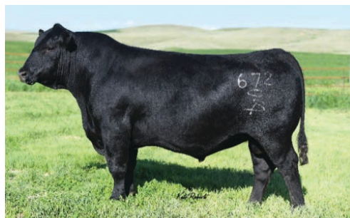
GB Fireball 672 Sire of lot 65