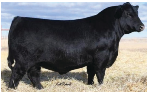
Square B True North 8052 Sire of lots 39-40